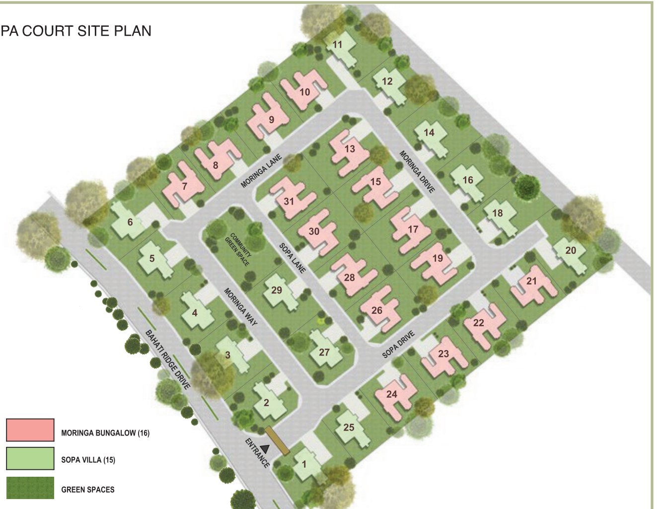
SOPA COURT SITE PLAN

USD 80,000 PER 1/4 ACRE FULLY SERVICED PLOTS